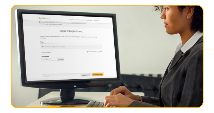
Send text or email to beneficiaries to complete SOA prior to meeting.

Each beneficiary will receive a text or email with a request to complete the SOA on their laptop, phone or tablet.